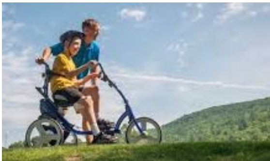
Kids Mobility Network

Charities such as these provide critical and essential programs to elevate our community's youth and to change their lives.