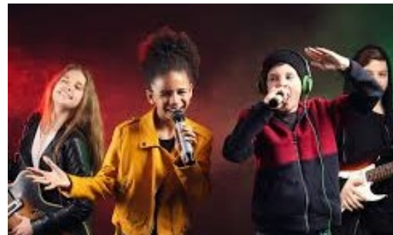
A Child's Song

Therapies for Hope customized therapeutic developmental health programs for more than 70 children annually – with a 100% acceptance rate of data for the Rutgers Longitudinal Study.