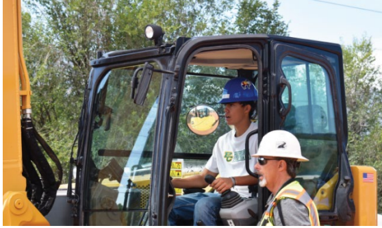
Careers in Construction Colorado

Charities such as these provide critical and essential programs to elevate our community's youth and to change their lives.