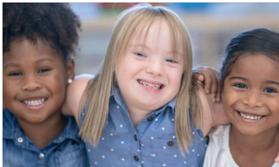
Therapies for Hope

Kids Mobility Network had a big year, serving 261 children and providing 272 pieces of medical equipment – representing a nearly 40% increase in community benefit over the previous year.