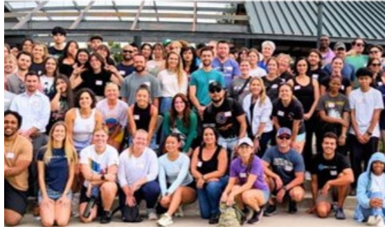
Sherman Entrepreneurship DBA Highview

Careers in Construction serves 83 high schools in the state and has placed 1,655 program graduates in jobs in the construction industry. More than 82% of program graduates are working full-time in construction earning an average of nearly $20/hr.